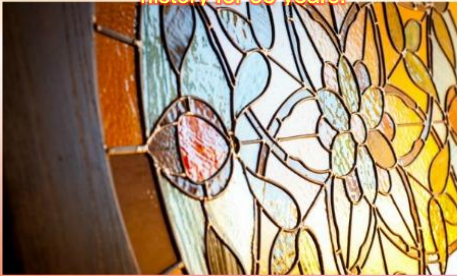
THE OLD KNOX CHURCH STAINED GLASS

Serving the Regina Community Preserving our history for 55 years!