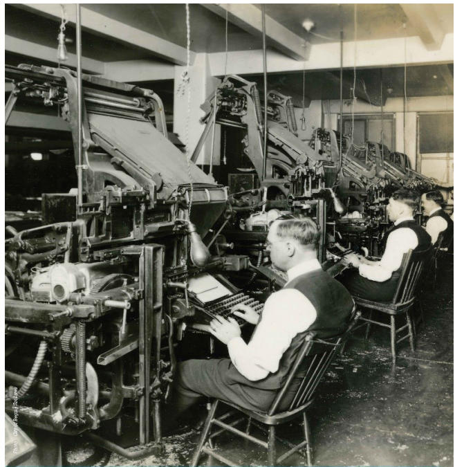
Leader-Post Composing Room circa 1920 - 1922